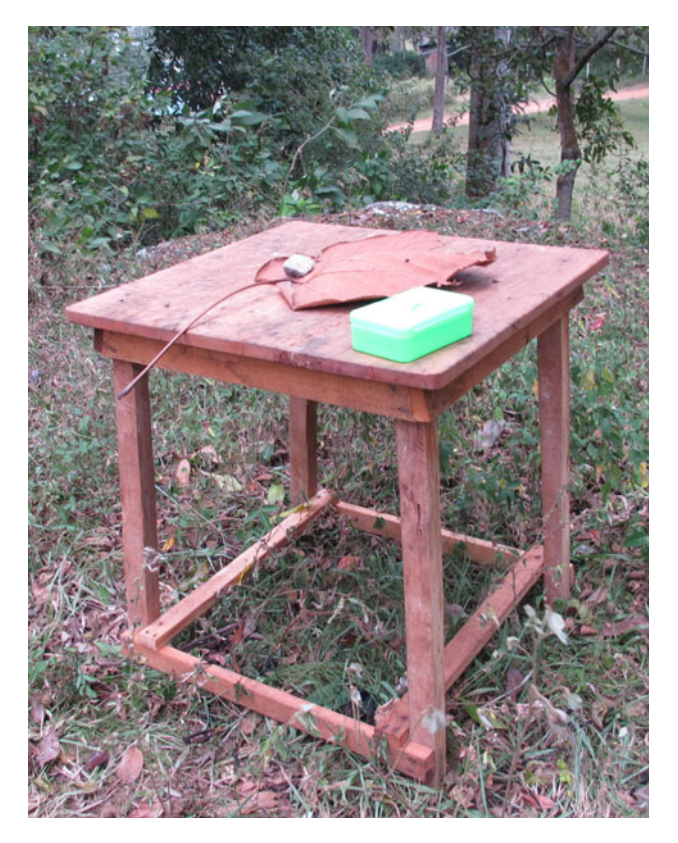
Fig. 2 Feeding platform set up for Experiment 3, with reliable beacon provided

For Experiments 2A and 2B, results did not differ from chance and it was considered advantageous to determine the strength of the null hypothesis relative to the alternative hypothesis using a Bayesian analysis (Gallistel 2009; Kruschke 2011). The distribution of individual success rates (visitations to real vs. sham sites) during these two experiments were examined with one-sample t tests, first